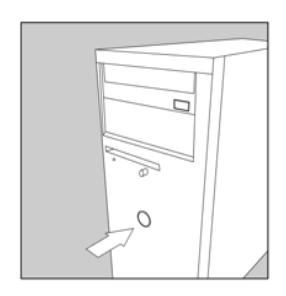
Turn on your computer.

During the software installation, you <u>must</u> install the DRIVER. You can install the E-Z Media Box 2.0<sup>™</sup> software at a later time. Frequently check for updated webcam software by visiting our website, www.microinv.com.